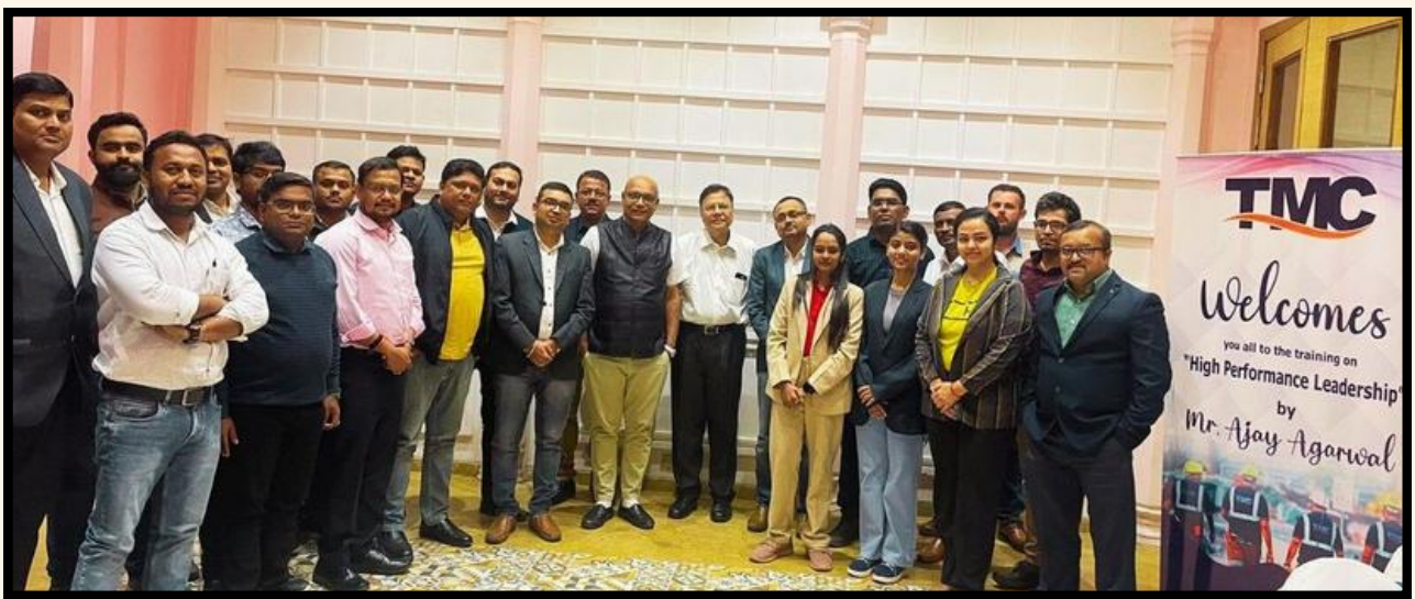
Training on "High Performance Leadership"