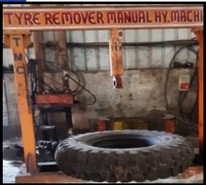
Tyre Removal Hydraulic machine was made by Team Sial Ghogri