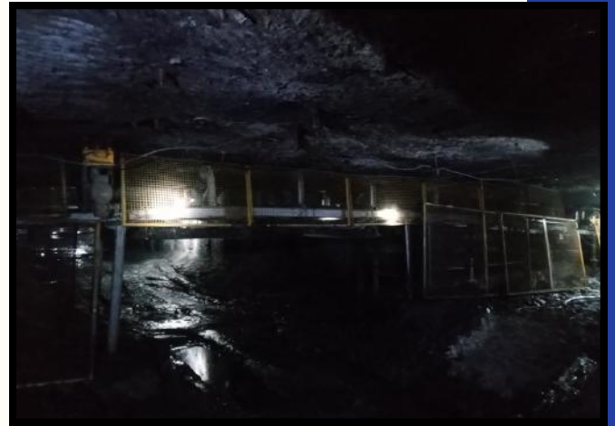
The Best from waste campaign was held at Bicharpur Site