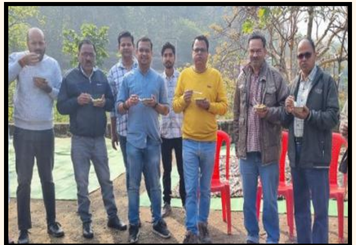
Staff enjoying "Family Picnic"