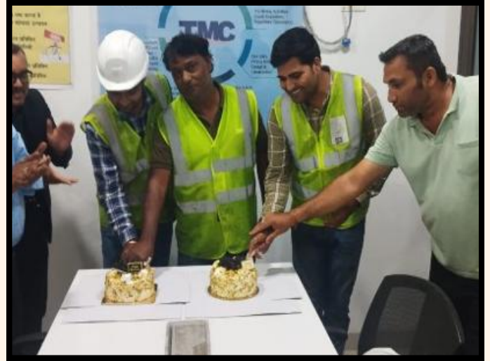
Employees' Birthday Celebrations