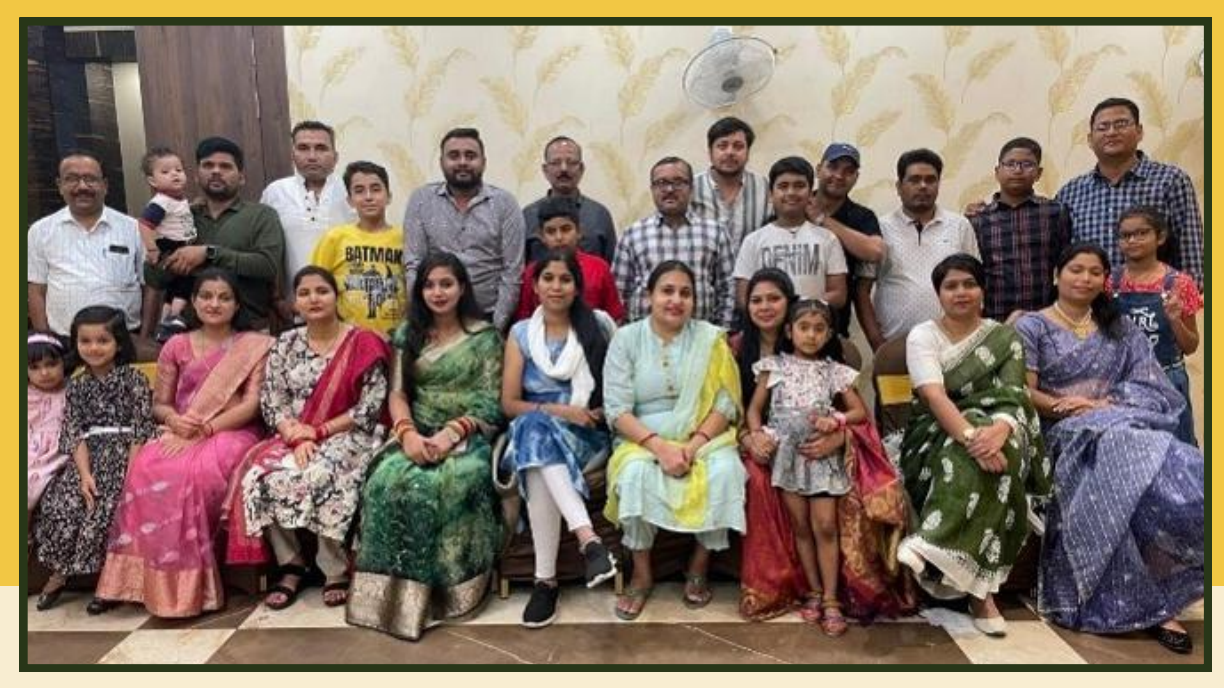
Family get-together of Team Bicharpur