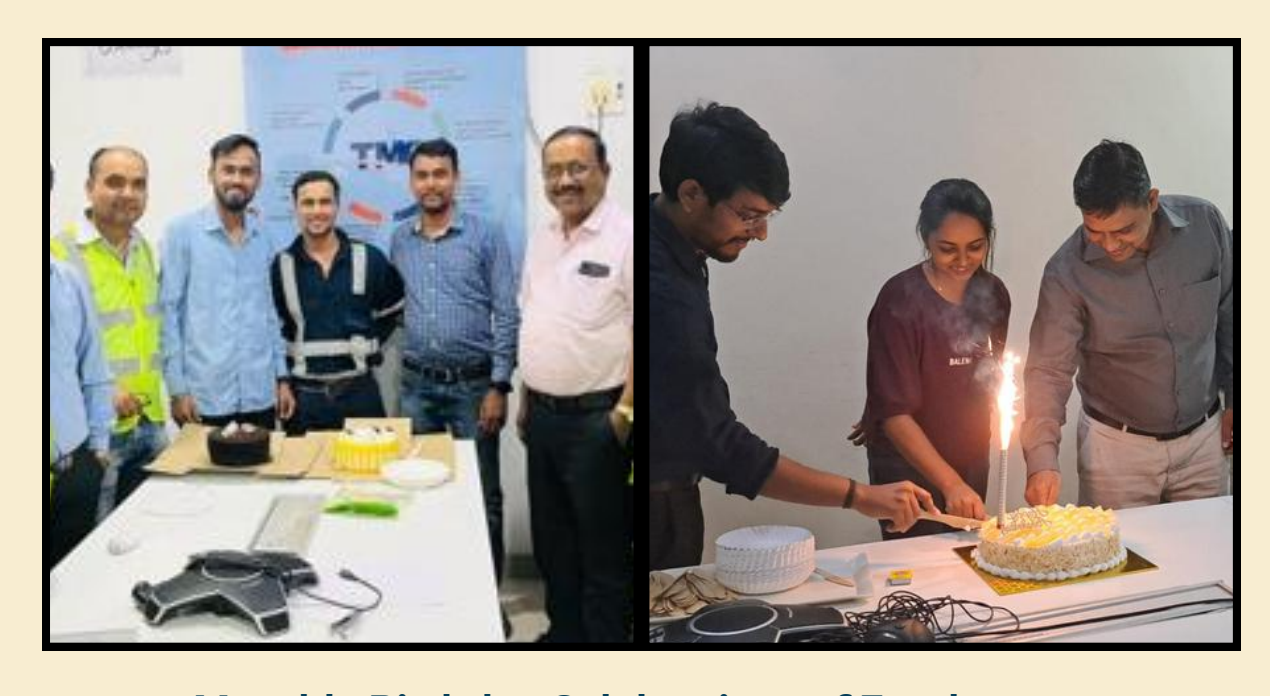
Monthly Birthday Celebrations of Employees