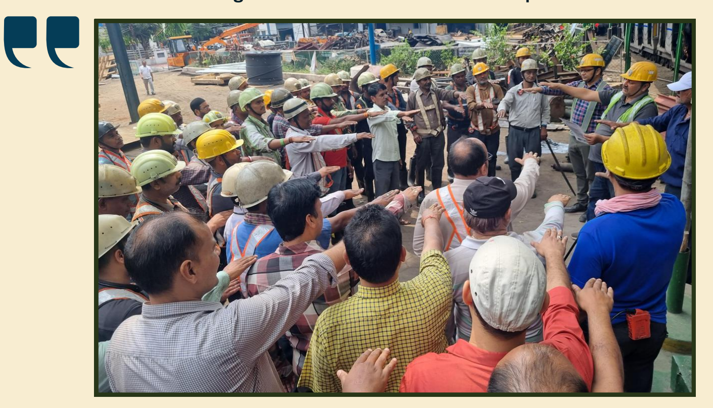
Team Churcha came together to take a meaningful pledge on World Health & Safety Day, underscoring their commitment to foster safety and health for all.