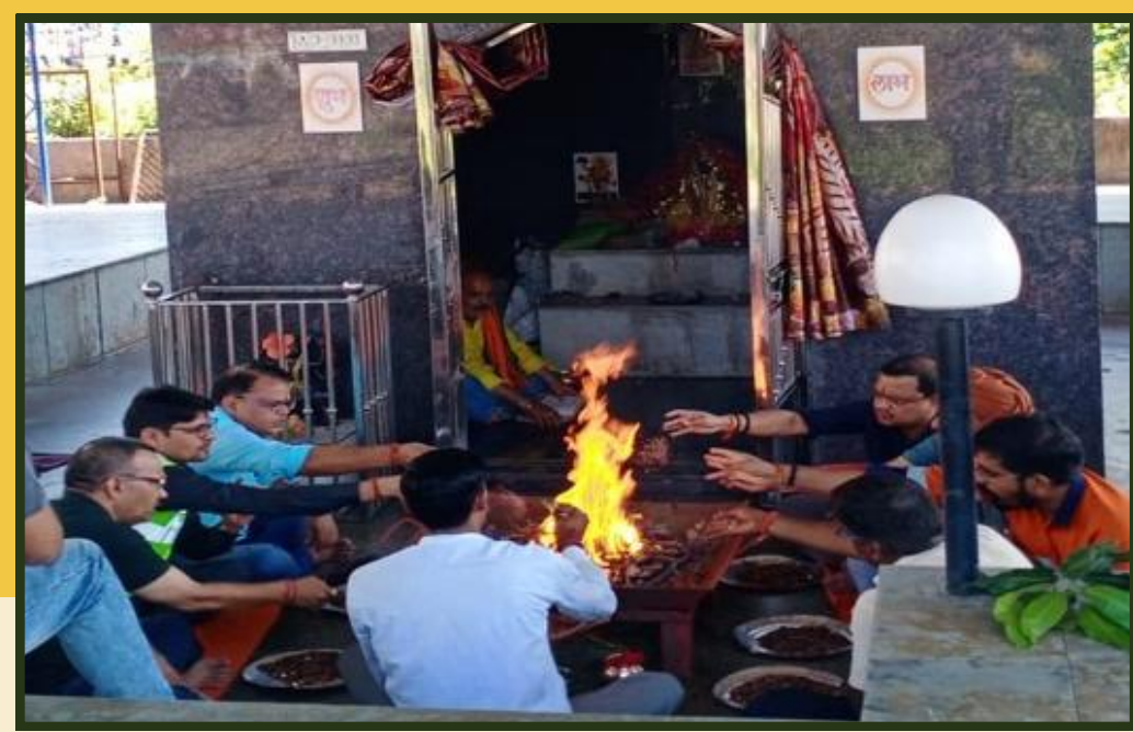
Our Sial Ghogri coal mine came alive with the spirit of Navratri.